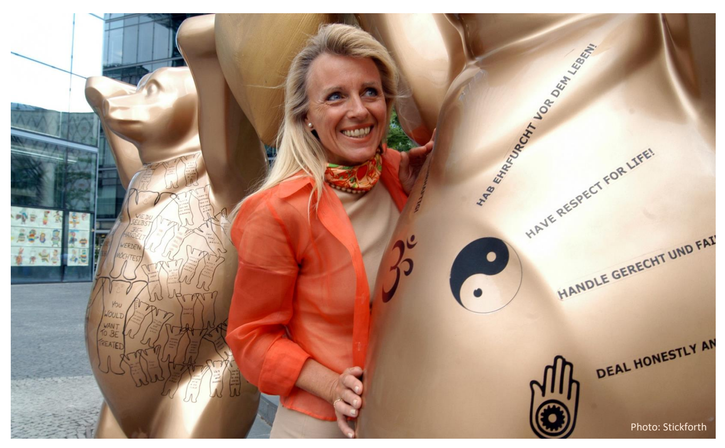
"It is better to light one small candle than to curse the darkness." (Confucius)