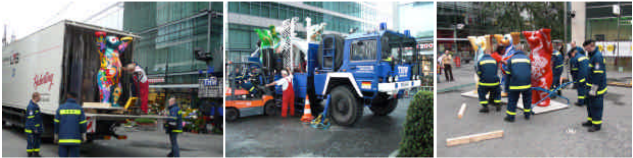
Photo left: The removal and transport company Haberling transported the Buddy Bears to their location at Neues Kranzler Eck for the Europe exhibition.