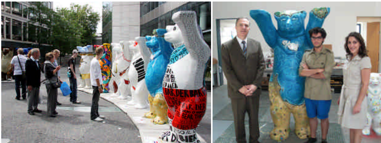
Photo left: The United Buddy Bear Malta “hand in hand” with other European Buddy Bears.