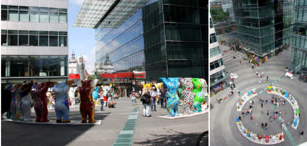
Photos: 27 European United Buddy Bears at Neues Kranzler Eck , Kurfürstendamm

Special United Buddy Bears Exhibition in Berlin 20 th July to 4 th September 2009 – Neues Kranzler Eck